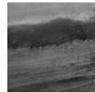
Honorable Mention Skip Motes, Newburyport, MA "Orchard", Mixed Media