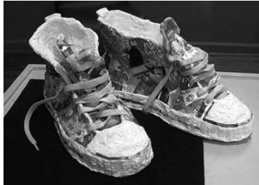
"Sweet Sneaks" by Brittany Hill