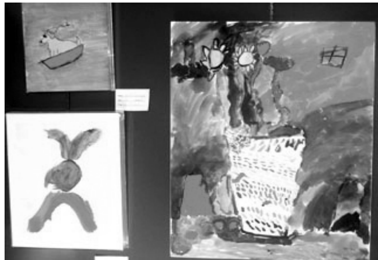
Artwork by young artists, ages 6-10, at the Young Budding Artist Show, Laura Coombs Hills Gallery, February, 2004.