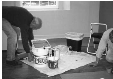
The painters get ready

spruced up and all pitched in on the project when they had time to drop by and paint. Everyone had a good time working together and getting to know each other better. Time was of the essence since the Winter Show Part I was due to open. Most of the work got completed just in time for receiving day.