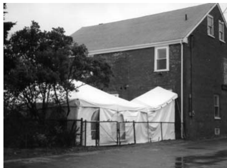
NAA Auction Tent

We have every hope that this year's event will be even more successful and look forward to your participation. We invite you to call the NAA office (978-465-8769) if you would like to be of assistance during this