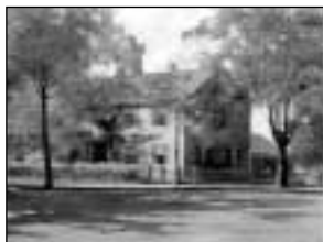
"The Old House at Newburyport," oil painting by Laura Coombs Hills, 1887