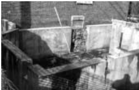
Foundation for new annex