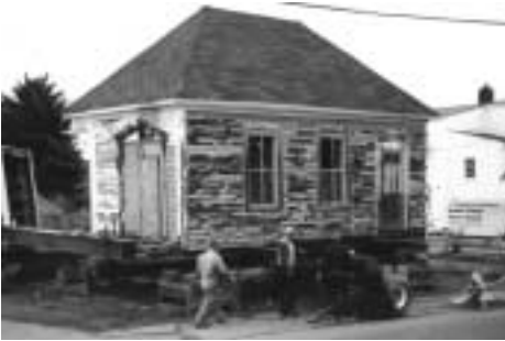
The NAA annex to be moved, placed on its new foundation, and renovated

The Newburyport Art Association Member Newsletter • www.newburyportart.org • March/April 2002